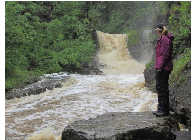
Quality Creek in Flood