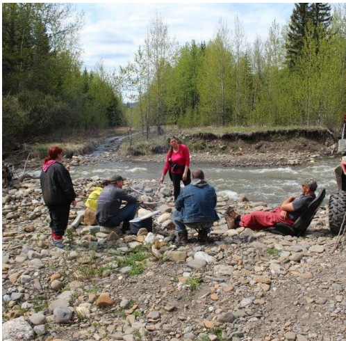
Lunch where the Five Cabin Creek trail meets the old road to Kinuseo Falls

A great ride on a freshly cleared trail, that follows along the Five Cabin Creek drainage. Spend some time exploring the Core Lodge area, with its fantastic views of the Rocky Mountains to the south and west, and Roman Mountain where caribou are often found. Then head down the Five Cabin Creek trail into the Kinuseo Creek valley, to where it meets the old (deactivated) road to Kinuseo Falls. From this point a whole other riding experience becomes possible in the South Grizzly area.