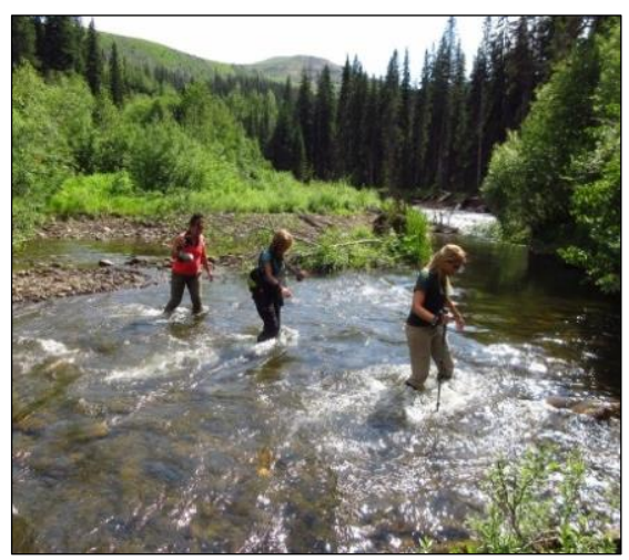
Bullmoose Creek Crossing