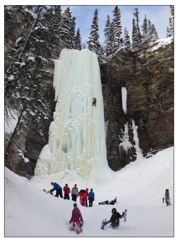
Bullmoose Falls in Winter

Bullmoose Falls is a popular snowshoeing and ice climbing destination in winter. The creek never freezes where the trail crosses, so wear appropriate footwear. Use extreme caution when approaching the frozen falls, as large chunks of ice can fall off at any time. This bowl is also prone to avalanches.